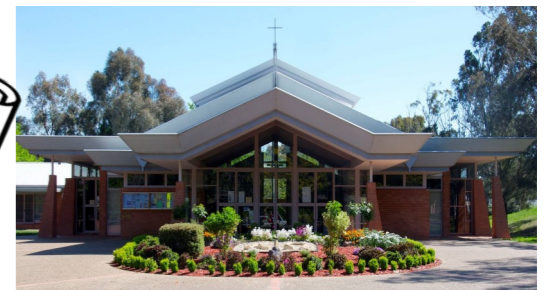
St Michael's Church Tyrrell Cct Kaleen

Acknowledgement of Country We acknowledge the Ngunawal people, as Traditional Owners of the land where we gather today and pay our respects to Elders past, present and emerging.